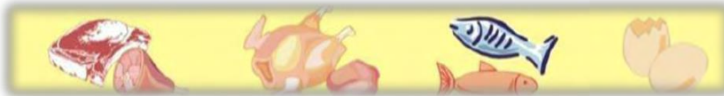
All kinds of Meat